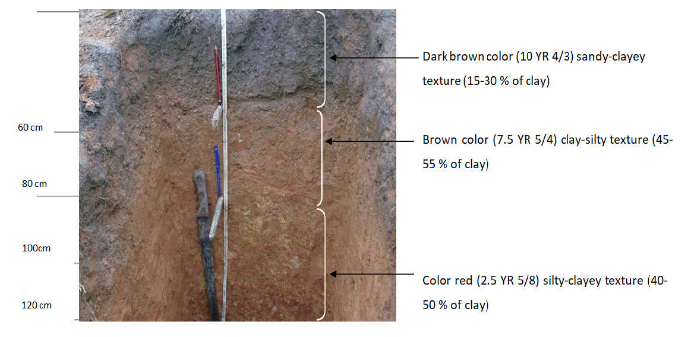
Fig. 2. Main soil colors of the profile opened on the study site

Soil morphology characteristics of the study site in the horizon 0-20 cm: The soils are slightly humiferous, with a sandy-clayey texture. They are soft and have good internal drainage. However, these soils have a compact horizon with a high rate of coarse elements (> 50 %), consisting mainly of ferruginous nodules, gravel and quartz fragments. Soil colours are in the range 10 YR with dark brown color as shown in Figure 2.