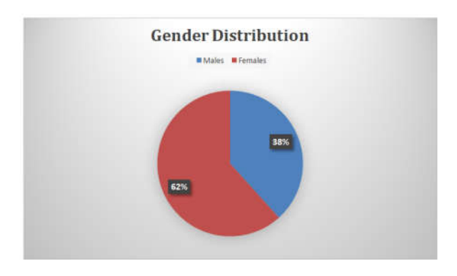
Graph 1. Showing Gender Distribution