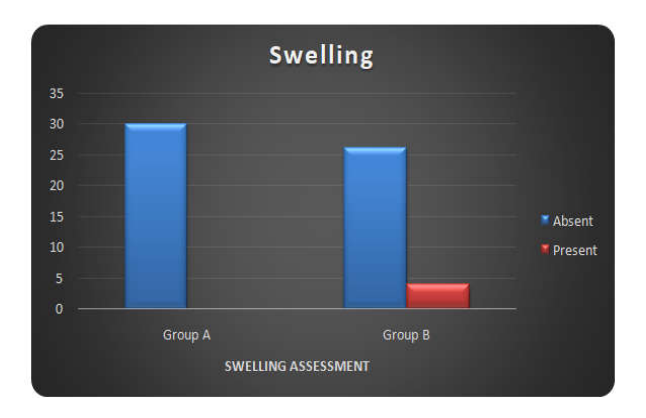
Graph 4: Swelling compared between Group A and Group B

Thus, the rational use of antibiotic is utmost importance in dental and oral clinical practice (Poveda-Roda, 2007). In our study we aim to evaluate the efficacy of use of postoperative antibiotic regime in asymptomatic tooth extraction.