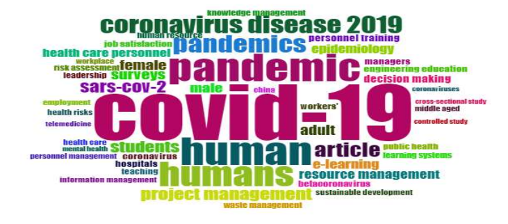
Figure 2. Most Cited Keywords

Most frequent keywords relating to COVID-19 are 'Pandemic', 'Crisis Management', 'Health Policy' and 'Public Health'. Most frequently used keywords relating to Human Resource Management are 'Digitalization', 'Job Satisfaction', 'Telework Performance', 'Remote Work', 'Leadership Management', 'Health & Safety' and 'Well-Being'.