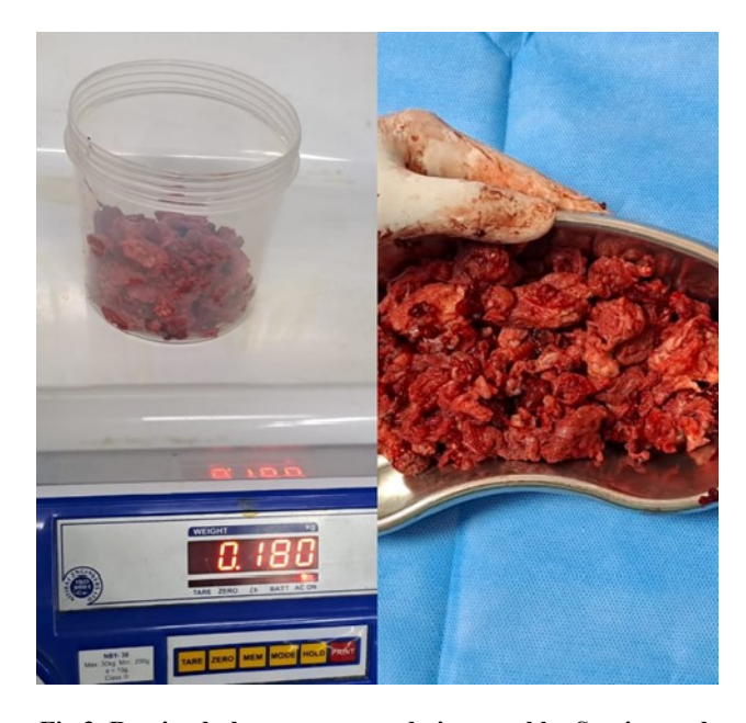
Fig.3. Retained placenta removed piecemeal by Suction and Evacuation

Ultrasound and dopplers are sufficient for diagnosing placenta accreta, increta and percreta in most cases. According to a recent modified Delphi consensus study, i)loss of the 'clear zone'ii) myometrial thinning, iii)bladder-wall interruption, iv) placental bulge, v) uterovesical hypervascularity, vi)Placental lacunae and vii)bridging vessels should be included in the examination of high-risk patients and the routine mid-gestation scan report.(3)In our case, ultrasound from 28 weeks period of gestation showed multiple placental lacunae. Obstetric hysterectomy has been the mainstay but conservative methods and fertility sparing can be done, these methods include placenta left in situ, cervical inversion technique and triple-P procedure.